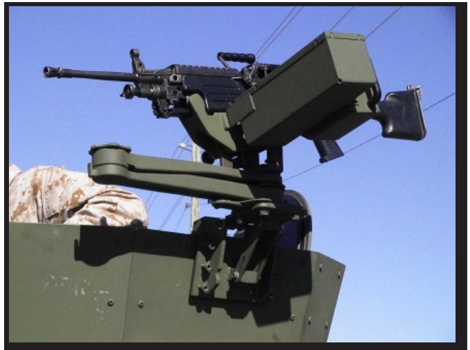
Clamp-on 30 Adapter for any vertical surface