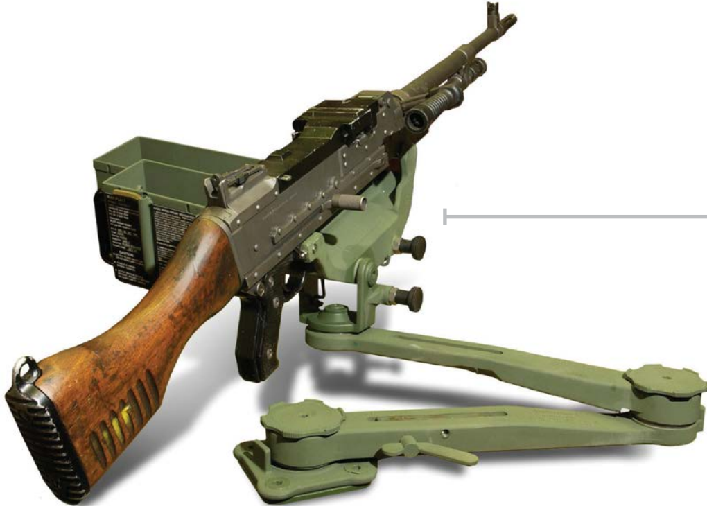
PLATT SWING MOUNT

for MAG-58/M240 and Minimi/M249 machine guns