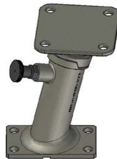
LAV Separator for LAV 25mm gun turret