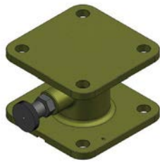
Separator 3-inch, general purpose